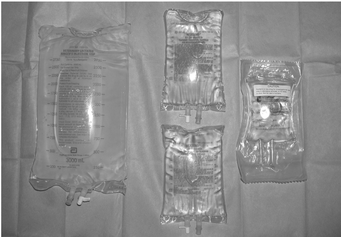
Figure 1: Theoretical fluid volume requirements to achieve equal resuscitation after a 1L blood loss. Pictured are a 3L bag of LR, 2-500 ml bags of Hextend and a 250 ml bag of HSD.

The treatment of significant hemorrhage requires fluid resuscitation, but it is recognized that the presence of hypotension, environmental and tactical conditions, limited expertise of the medic and/or the presence of mass casualties can lead to significant time delays and failures in gaining access to peripheral veins in the far-forward combat arena. Based on evidence to suggest that intraosseous (IO) infusion is a viable route for the emergency injection of drugs and fluids [28] and that the technique was easy to learn by military first responders, 29 the US Army, through in-house research activities and outside contracts, has examined the intraosseous route as an alternative means of infusing resuscitation fluids for the treatment of hemorrhagic hypotension in experimental animals [2,30-32]. These studies have focused on HSD and have observed that a single dose of HSD induced essentially identical hemodynamic effects through the IO route as the IV route [30-32]. In addition, where studies with IO infusion of isotonic crystalloids indicated that such administration could not resuscitate from hemorrhagic hypotension in a timely manner, [33] IO administration of HSD could be effective [31,32].